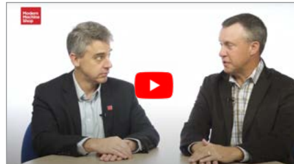
How to Succeed at Lights-Out Machining