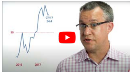
Gardner Business Index Provides Actionable Insights